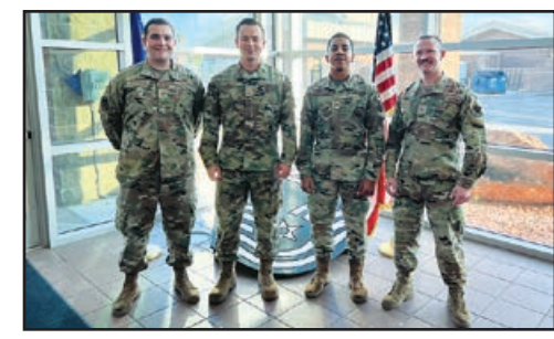
Flight Line Safety Raptor Aircraft Mainenance Unit 757 AMXS Nellis AFB, NV