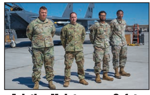
Aviation Maintenance Safety Strike Aircraft Maintenance Unit 757 AMXS Nellis AFB, NV

Aircrew Safety AQUILA1 16 ACCS Robins AFB, GA